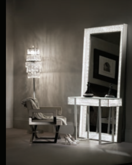
The London Furniture Collection