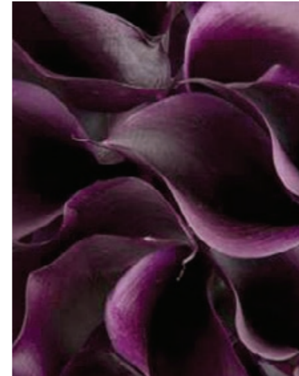
Rich Dark Amethyst