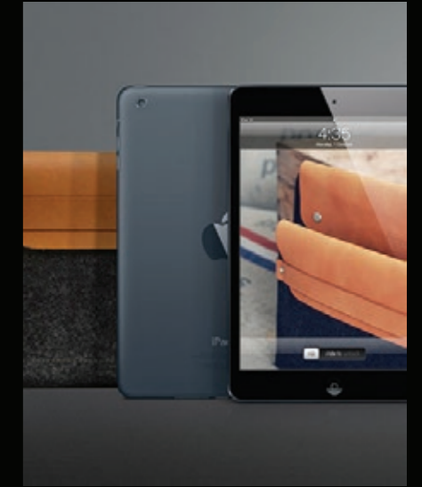
Influenced by Technology

The London gifting range was conceived as complementary accessories to the furniture range which launched in 2012. Its demographic was primarily male-focused, specifically corporate gifting and executives.