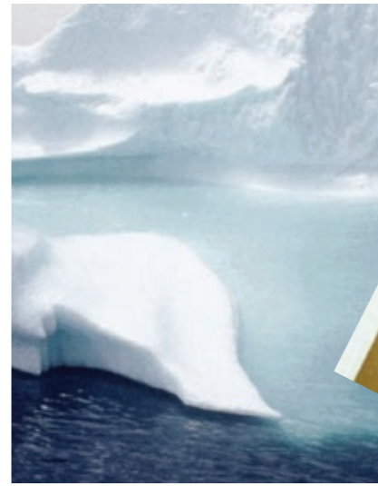
Ice White Finish