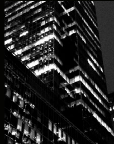
Inspired by London's City Lights