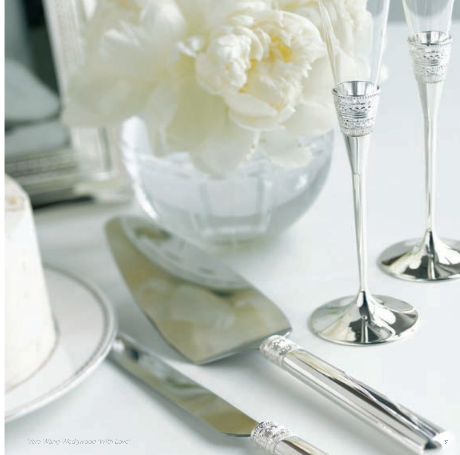
Vera Wang Wedgwood 'With Love'.

ENJOY CREATING YOUR BRIDAL REGISTRY LIST!